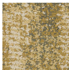
Golden 35210 LRV 29.7