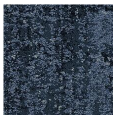
Overdye 35496 LRV 8