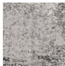
Greige 35516 LRV 36.9