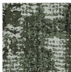
Ivy 35375 LRV 15.7