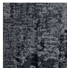
Raven 35505 LRV 8.1